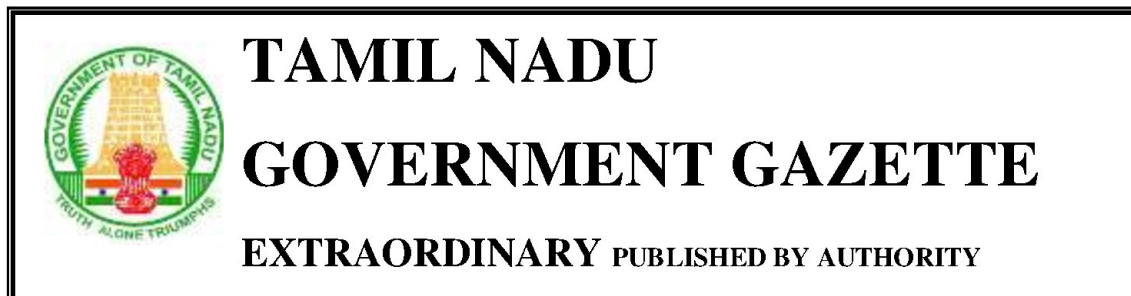
[No.35] MADRAS, MONDAY, JANUARY 20, 1992

THAI 6, PIRAJORPATHI, THIRUVALLUVAR AANDU -2023